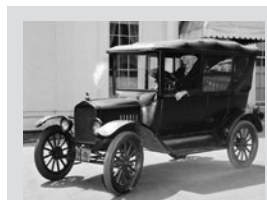
The Model T Henry Ford began selling Model T Fords in 1908. Not many people had cars in 1908, but a lot that did have cars owned Model Ts.